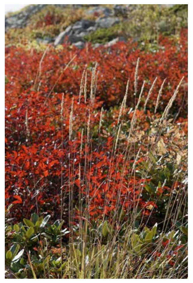
Vaccinium arctostaphyllos and grasses