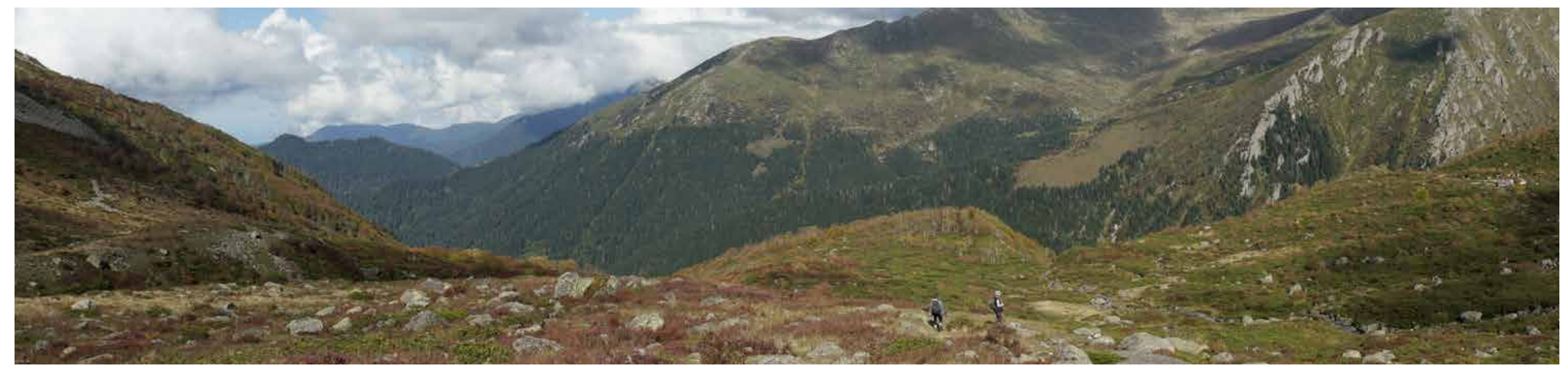
Autumn in the Kackar

vaccinium, now firmly in the throes of autumn.