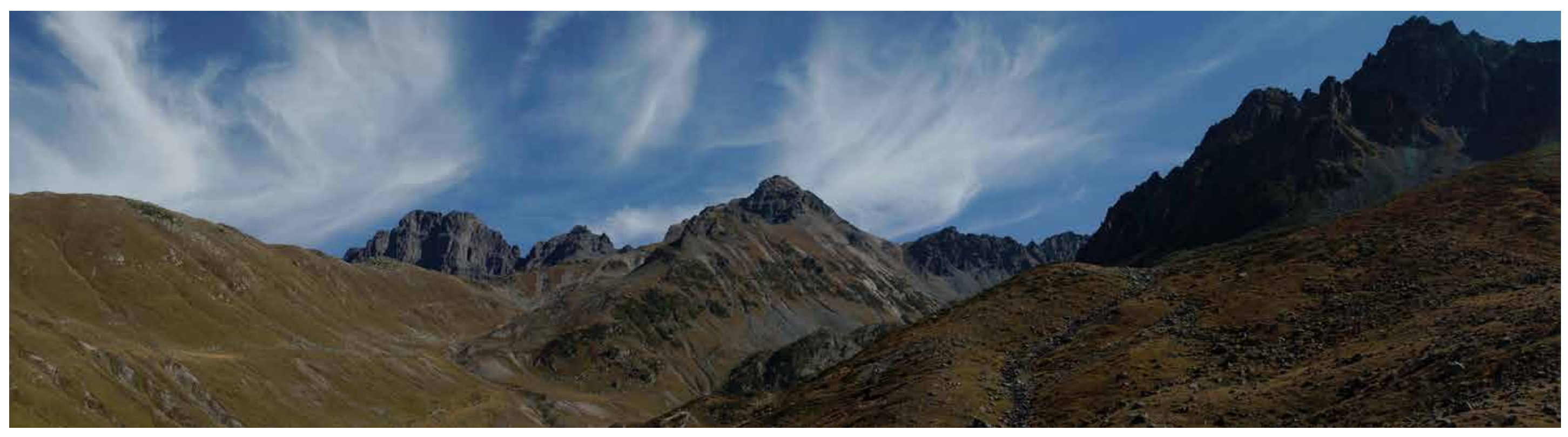
Sorbus aucuparia and autumn birches

gathering big bags of berries on the way having enjoyed the glorious autumn hills in solitude. later, this time to the high alpine tarn of Avusor, we couldn't find any fresh clotted cream to buy!